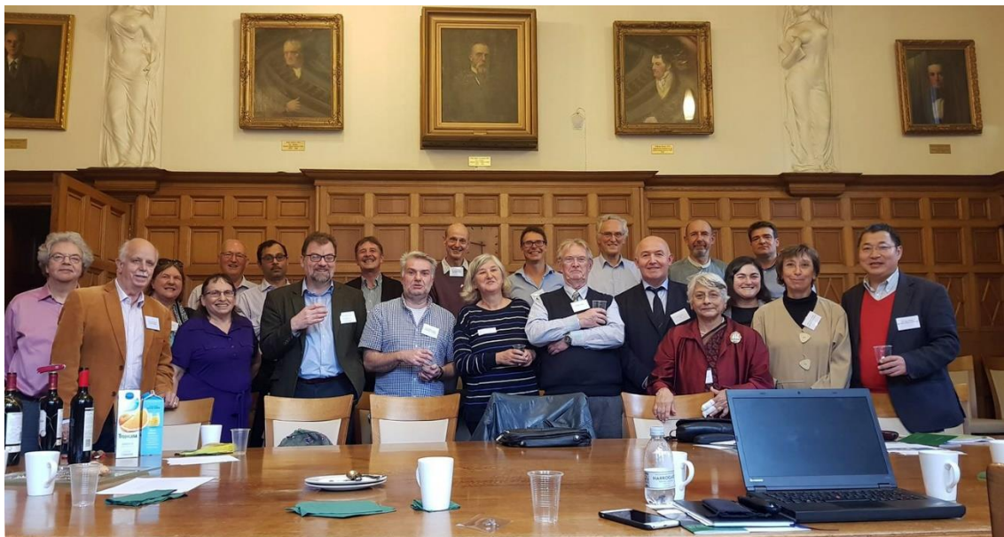
Many of the attendees stayed for the reception afterwards, enjoying a glass of wine with the speakers.