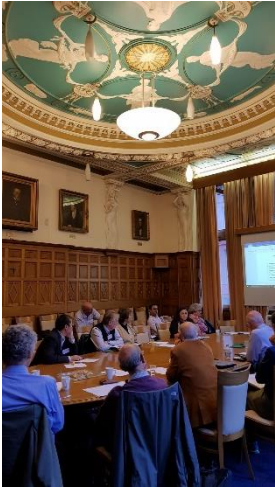
Attendees enjoy some discussions over coffee before the meeting.